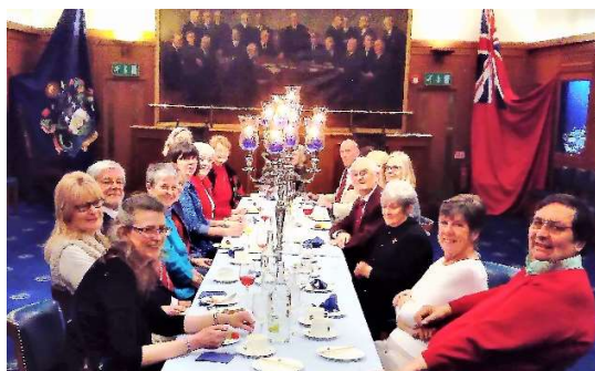
LUNCH AT HQS WELLINGTON AFTER OUR VISIT

In my year as Mistress Firefighter I organised a visit to Two Temple Place. This is one of London's hidden architectural gems – an extraordinary late Victorian mansion on the Embankment, built in the gothic revival style by William Waldorf Astor, arguably the richest man in the world at the time. And it was just for his use as an office for the Astor estate! It has a richness of natural materials, wood paneling and carvings of all types lining the walls, with statues also in wood showing famous figures from American and French literature, beautiful marble floors and stained glass.